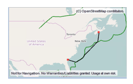
No ECA Optimization